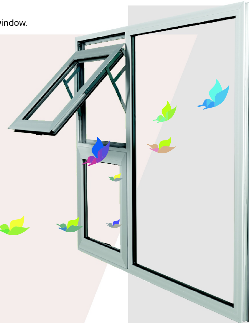
A 3D presentation of the Crealco Swift 30.5 cross-section